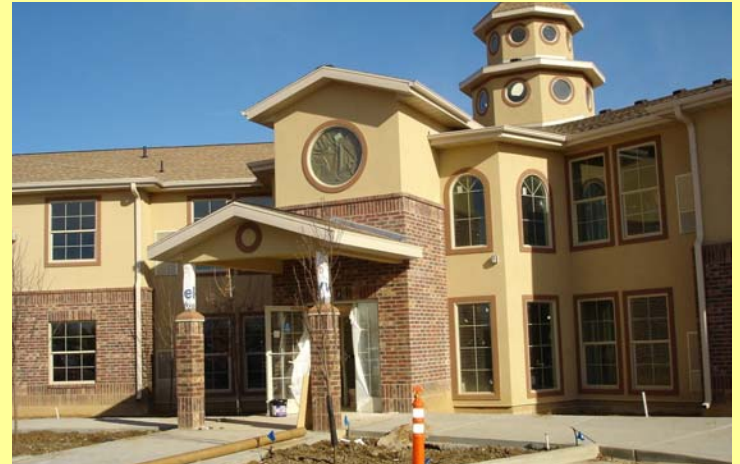
Victoria Ridge Apartments, Ogden

Step 5. Agency submits preliminary rating and any incremental costs with overall project funding request (loan and tax credit financing)