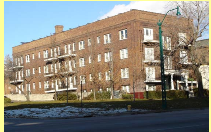
Ritz Apartments – Salt Lake City