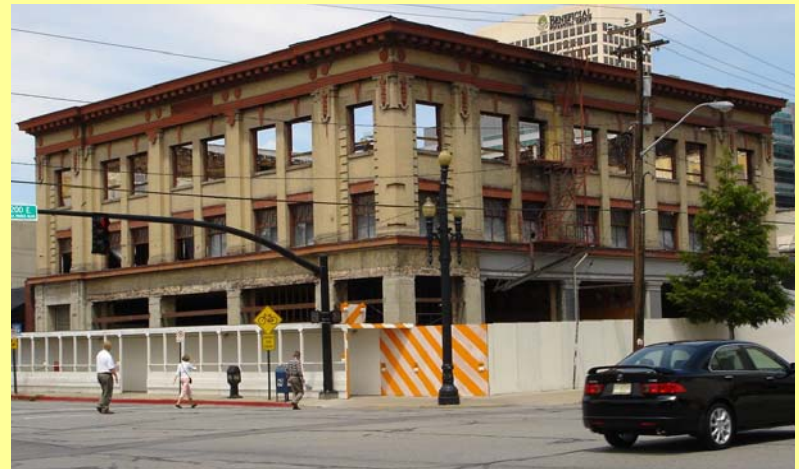
Stratford Apartments – Salt Lake City